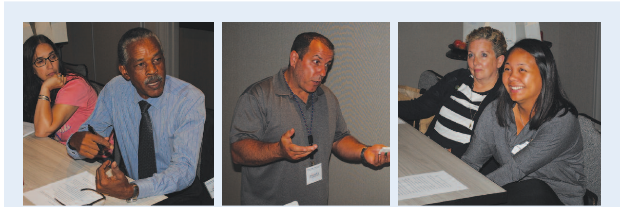
Human Rights Community & Women's Services • Education Committee Flight Safety Committee • Ground Safety Committee • Legislative Committee

OSM Aviation Short Haul U.S. (Norwegian Air): Approximately 100 Flight Attendants have joined the IAM, with a goal of more than 200 by year's end. Their first contract includes immediate pay increases, additional holidays (including birthdays), paid be-