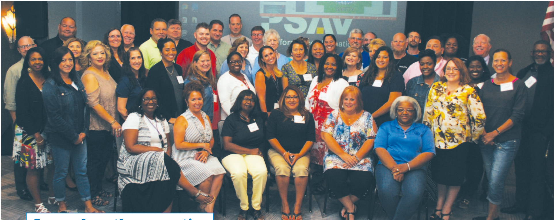
Scenes from the convention

Official Publication of IAMAW District Lodge 142